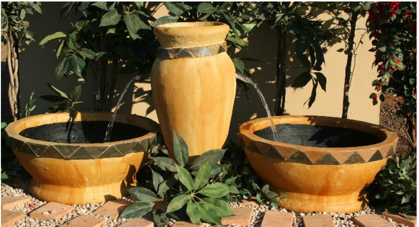
Slate Waterfeature 2E: (Half Pot Midi Slate x 2; Vase 900 Slate 2 Pour)