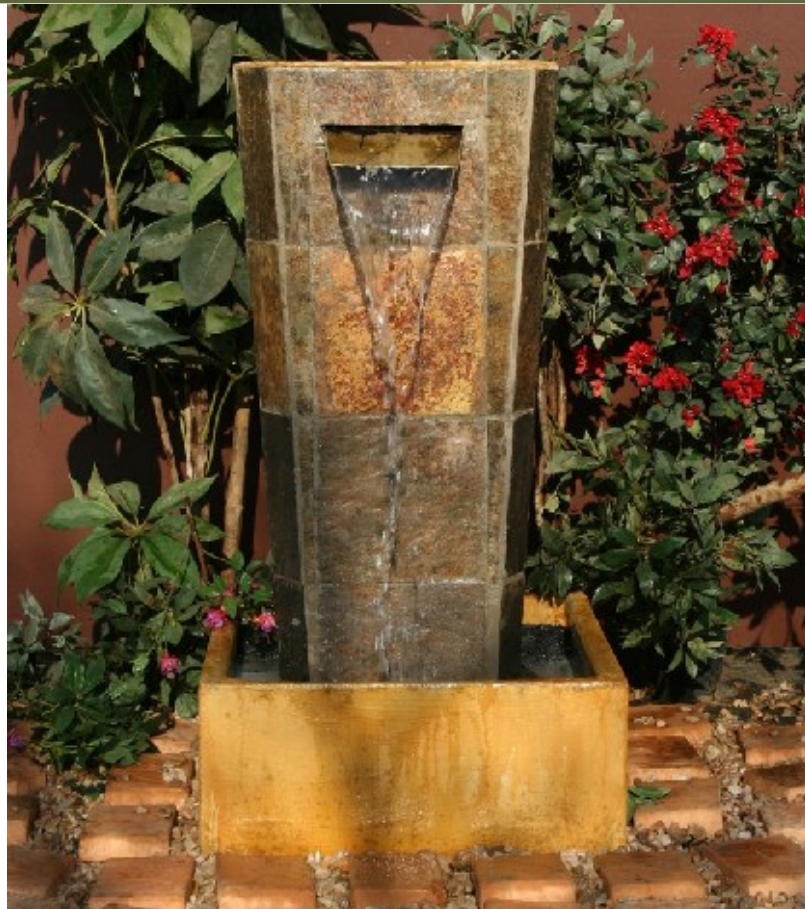
Slate Waterfeature 45A: (Flat Cube Slate; Square Pond 1000)