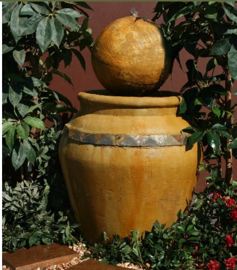
Slate Waterfeature 50A: (Urn Lrg Slate; Ball 530; Stand)