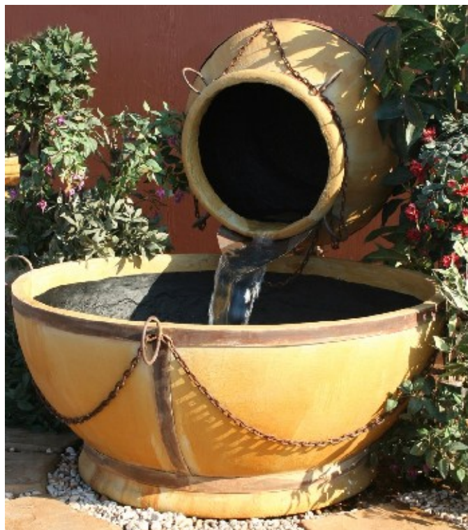
Steel Waterfeature 23B: (Half Pot 1.1 S&C; Full Pot Midi S&C Leaf)