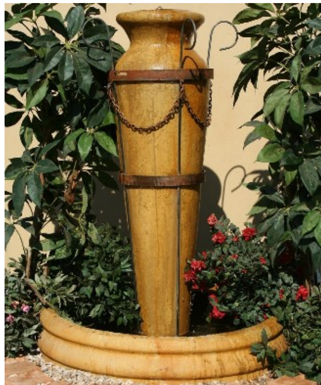
Steel Waterfeature 36A: (Vase 1.9 S&C Overflow; Flatbowl Med Painted)